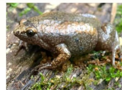
NARROW- MOUTHED TOAD

The Chesapeake Bay Trust funded a grant to obtain six recorders and CHESPAX lent an additional four.