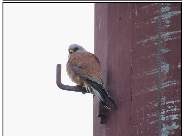
Top: Maghreb Magpie