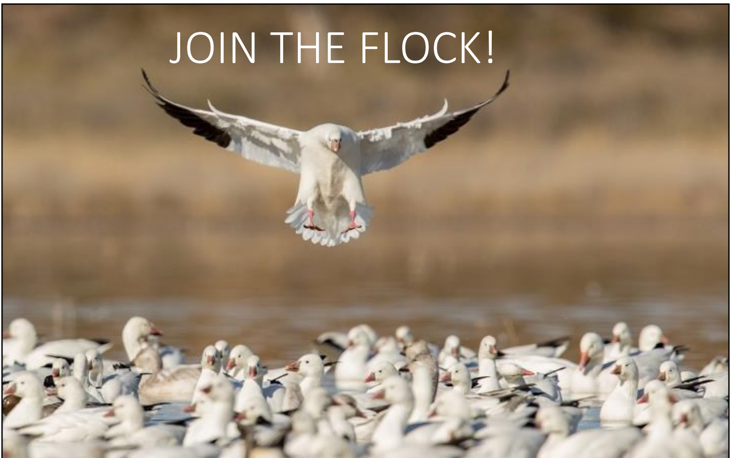
Ross's and Snow Geese

Act Now! Contact somdaudubon@yahoo.com for more information about volunteering with SMAS.