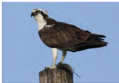
Osprey

Please consider supporting the National Audubon Society by becoming a member. Your membership automatically enrolls you as a member of Southern Maryland Audubon Society. You will support their avian conservation efforts, and receive four issues of National's award-winning Audubon magazine. To join the National Audubon Society, go to: http://www.audubon.org/membership