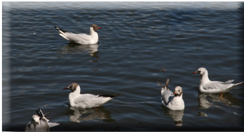
Black-headed Gulls, Edinburgh

But, the passerines that we had hoped for were very secretive. There was a Eurasian Robin that sang in the shrubs outside our Edinburgh hotel room every morning and we only caught glimpses of it on a few occasions. Their chip note sounded remarkably like a Northern Cardinal so whenever we thought we were hearing a cardinal, it was actually a robin. We were lucky one morning and ran into a mixed flock of Eurasian Robins and Eurasian Blue Tits in the Royal Terrace Gardens in Edinburgh. Otherwise, we heard tits calling and singing in Edinburgh and London and only got fleeting glimpses of them.