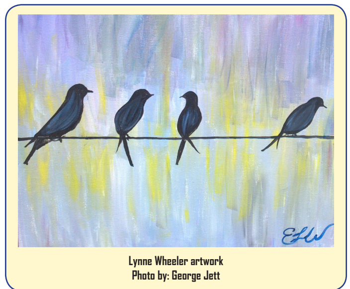
Lynne Wheeler artwork

It is 7:00 a.m. Friday morning and I reluctantly board the boat that is going to take us back to the mainland. I don't dare take my eyes off the island as we leave. This time on the dirt road I am slowly dragging my suitcase back to my car. I get in, sit in the driver's seat and place the key in the ignition but I don't turn it. I want to absorb the last little bit of experience before I drive away. I finally bring myself to turn the key; I back out of the parking area and head home. I ended up with 18 life birds, brain stuffed with knowledge, stories from decorated Ornithologists, always a full stomach, and experiences I will never forget.