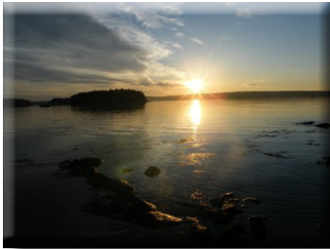
Sunrise from Hog Island

What a week it was on Hog Island. It was filled with morning bird walks, boat trips to other islands, mainland field trips, and amazing food. The island itself is beautiful, with habitat that I have never seen let alone hiked through. There were classes from the instructors on everything birds from evolution to feathers and molts. Speaking of the instructors, they were prominent professors and experts in all things avian. We took boat cruises to two islands out in the bay. One was a breeding ground for three species of terns, Black Guillemots, Laughing Gulls, and what everyone came to see, Atlantic Puffins! There were interns staying on the island compiling breeding research on the puffins and tern species. Our other boat trip was to another breeding island, this one home to Great Blue Herons. Stepping onto this island was almost like stepping back in time. Heron