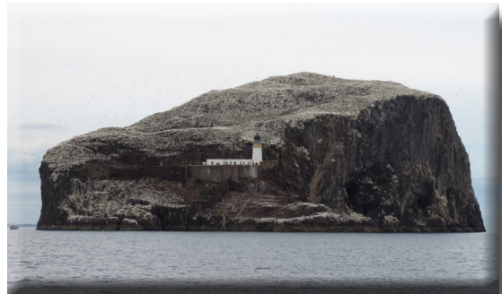
Bass Rock, Scotland

In all, we only saw 58 species during our stay of which 27 were life birds. Not too bad considering we were in conference talks most of the first week and walking to all of the major tourist attractions in London the next four days!