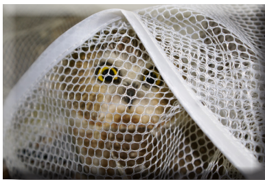
Northern Saw-Whet Owl

And speaking of next year, we hope to get new nets before the fall, as the nets used in 2012 were old nets borrowed from another station. The net array at Point Lookout included 4 nets in 2012, but could be expanded to 5 or 6 nets next fall. Each net costs about $100, so we are looking