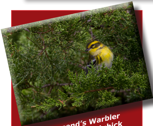
Townsend's Warbler

It is hard to believe that it's nearly time for Christmas Bird Counts. Maybe the October Nor'easter that dumped snow north of us started things, but I've noticed (well truthfully the dog noticed first) the arrival of Dark-eyed Juncos in the neighborhood. I should have been prepared as I have been hearing Golden-crowned Kinglets for weeks.